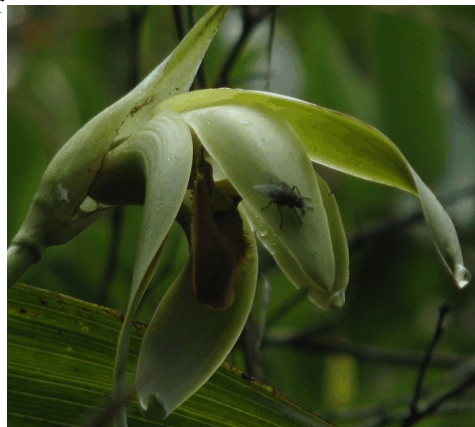
Ida longipetala in the El Pahuma Reserve, Ecuador.